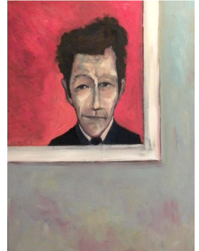
Singer Hanging as a Painting, oil on canvas, 40" x 30"

My works are based on restructured memories. I don't work 'on site' or from reference. Instead, I take in and observe locales and people that interest me. At a later time, these images and feelings crystallize into paintings.