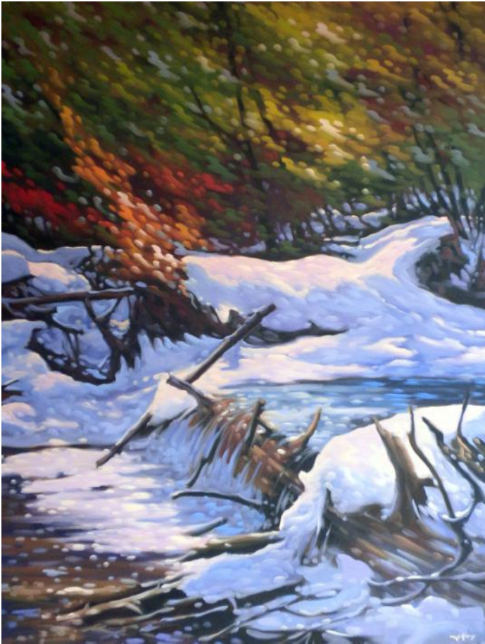
Eloge et eloquence, mixed media on canvas, 60" x 48"