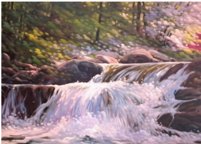
Le silence évoquateur, mixed media on canvas, 40" x 60"

From 1986 to 2004, he presented some 20 solo exhibitions in Canada and the United States. In 1992, Les Editions Broquet published a book covering the first period of his pictorial development. A few years later, to support the intrigue of the best-seller A Cry in the Night by American novelist Mary Higgins Clark, Telescene Film Group Inc. selected 21 of his paintings for a feature film produced by France, the United States and Canada. In 2004, as fully mature artist, he was featured in a second book presenting 112 of his works and a biographical text.